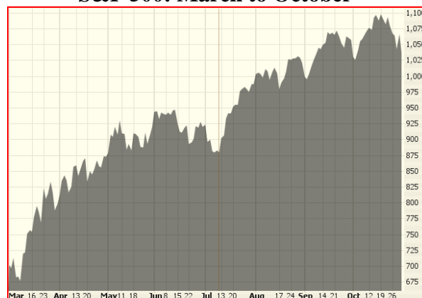
S&P 500: March to October

It would not be a stretch to admit that the market's rally has at least been pretty far and pretty fast!